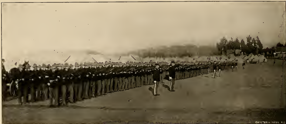
TRANSFORMING KANSAS CITIZENS INTO KANSAS SOLDIERS, SAN FRANCISCO, JULY 1898.